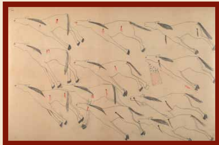
Red Horse (Minneconjou Lakota Sioux, 1822–1907), Untitled from the Red Horse Pictographic Account of the Battle of the Little Bighorn, 1881. Graphite, colored pencil, and ink. NAA MS 2367A, 08569900 National Anthropological Archives, Smithsonian Institution